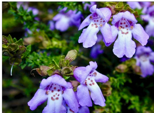
Figure 1. Prostanthera eurybioides in flower.

Approximately 1200 wild plants were estimated to occur in the Monarto and Mount Monster populations in 2010 (Pound et al. 2010). The species is listed as Endangered under the Australian Commonwealth Environment Protection and Biodiversity Conservation Act 1999 (EPBC Act), and Critically Endangered under IUCN criteria.