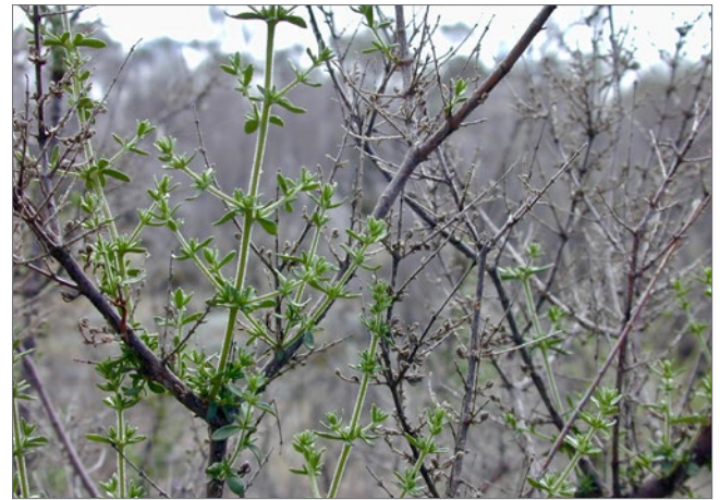
Figure 5. Regrowth of Prostanthera eurybioides shoots following earlier dieback of stems as a result of drought.

grazed plants which survived the drought (Veneklaas and Poot 2003, Virgona et al. 2006). Thus, although it was tempting to abandon monitoring after the population had been stable for 5 years, the next 5 years revealed an unexpected result which suggests that this plant is far more tolerant of grazing than was first thought. Indeed, grazing may assist these plants to withstand severe periods of drought. Interestingly, the first significant recruitment of new seedlings was observed following this drought (year 14), so the drought may also have played a role in overcoming seed dormancy (Ainsley et al. 2008).