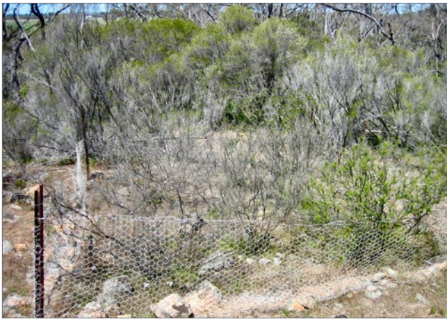
Figure 4. Fenced translocants of Prostanthera eurybioides showing dieback of 13-year old plants during a prolonged period of drought.