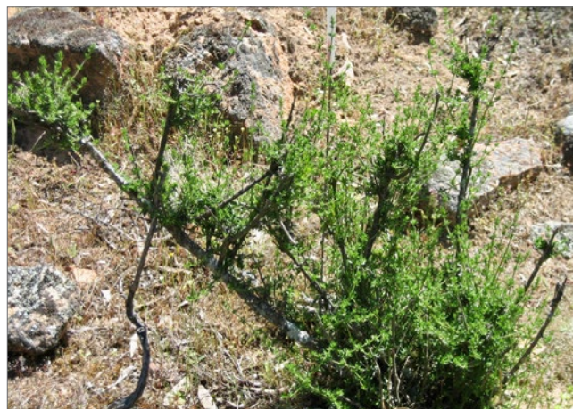
Figure 2. Regeneration of 13-year old transplant of Prostanthera eurybioides (unfenced) following repeated grazing.

The explanation for this unforeseen phenomenon lay in the size of unfenced plants which, due to frequent grazing, were about one third the size of fenced (ungrazed) plants (Figure 6). The larger size of the latter meant a far greater leaf surface area, higher transpirational losses and thus increased susceptibility to water stress, compared with the smaller, unfenced,