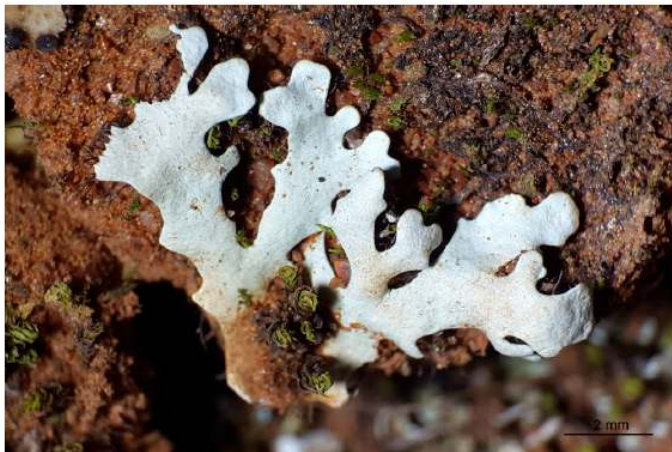
Xanthoparmelia sp., a member of the foliose lichen morphogroup.