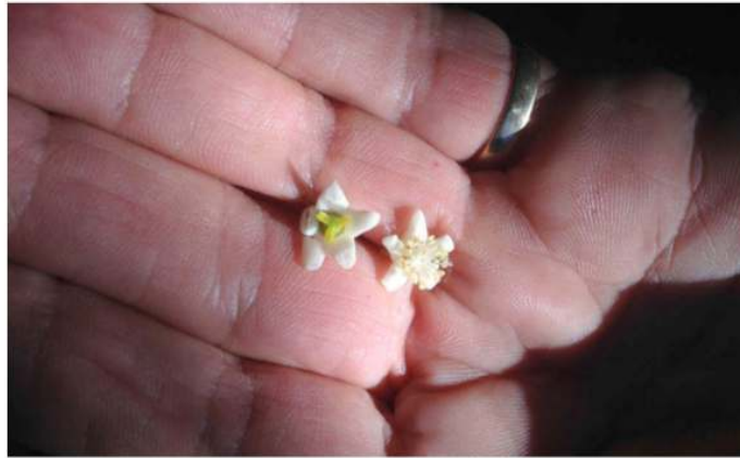
Figure 3. Male and female flowers collected from the same branch of tree 418.

Cover images need to be of high resolution (to be reproduced as A4 image).