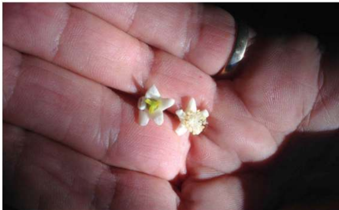
Figure 3. Male and female flowers collected from the same branch of tree 418.

Cover images need to be of high resolution (to be reproduced as A4 image).