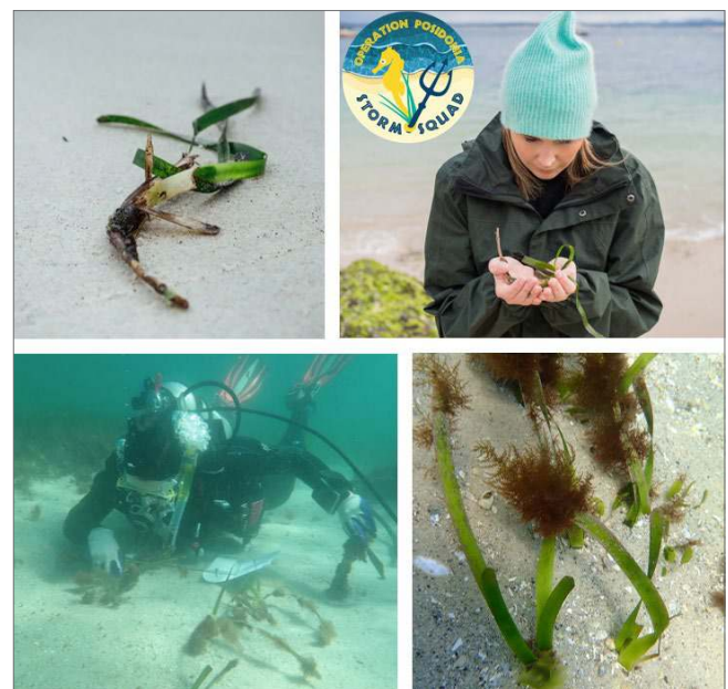
Figure 2. Posidonia australis transplantation sequence. Top left: Example of a fragment suitable for restoration; top right: beach collection by volunteers part of 'Operation Posidonia Storm Squad'; bottom left: Planting fragments into bare sand; bottom right: fragments nine months post planting.

'Operation Posidonia' outreach program has enabled the collection of more than 1000 P. australis fragments between October 2018 and April 2019. Fragments consist of shoots with attached rhizome. A pilot trial began in May 2018, replanting 267 fragments within two boat mooring scars (10 plots of 1 m x 2 m). Planting and monitoring were carried by SCUBA-divers (Figure 2). The fragments were anchored with wire pegs into old mooring scars consisting of either bare sediment (with or without stabilising jute-mats) or patches colonised by faster-growing seagrasses.