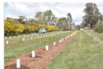
Audit of Seed Production Areas in NSW Report

An audit and investigation into past and current Seed Production Areas (SPAs) in NSW has also been undertaken by Murray Local Land Services. The audit investigated the availability of existing infrastructure (such as seed banks), and regional resources (such as local seed databases, vegetation guides and plant lists). It assessed whether the volume and species of seed grown in existing SPAs is sufficient and appropriate in different regions and undertook an investigation to explore barriers and opportunities in the seed and restoration sectors. Some of the key findings of the audit were that few actively managed SPAs were found, there is a current lack of sustained funding for seed banks, demand for seed is inconsistent and unpredictable due to funding variability, and there is poor understanding of licencing permits and conditions.