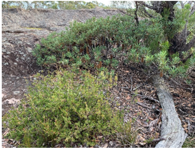
Darwinia fascicularis ssp oligantha unburnt low shrub in foreground, with Banksia paludosa ssp. astrolux in background.