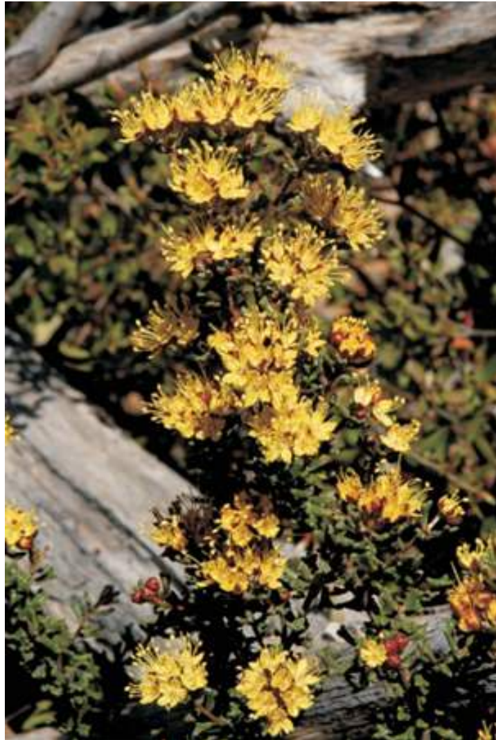
Phebalium glandulosum subsp. eglandulosum