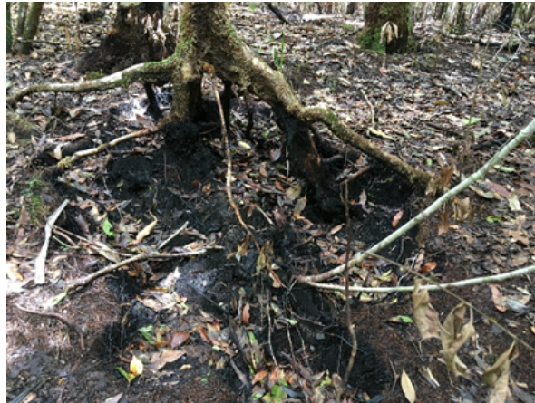
Burnt peat in rainforest in northern NSW.