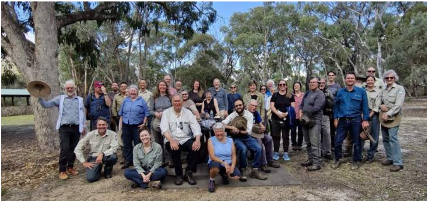
Attendees on the Wildflowers of the Granite Belt field trip.

You can view the final program on our conference website to gain an overview of the speakers and topics. Hot topics at the conference included: Resilient Country through the use of Rightfire, conservation genetics and translocations, building resilience to pathogens such as Phytophthora and Myrtle Rust, OCBILs (old, climatically-buffered, infertile landscapes), the threatened species situation in Queensland and prioritisation frameworks, and embracing citizen science with effective science communication.