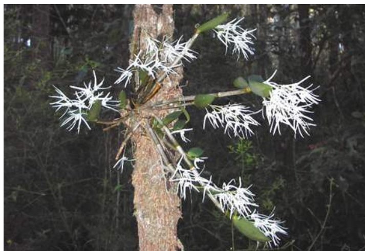
Top: Sarcochilus aequalis growing in Oxley Wild Rivers National Park.