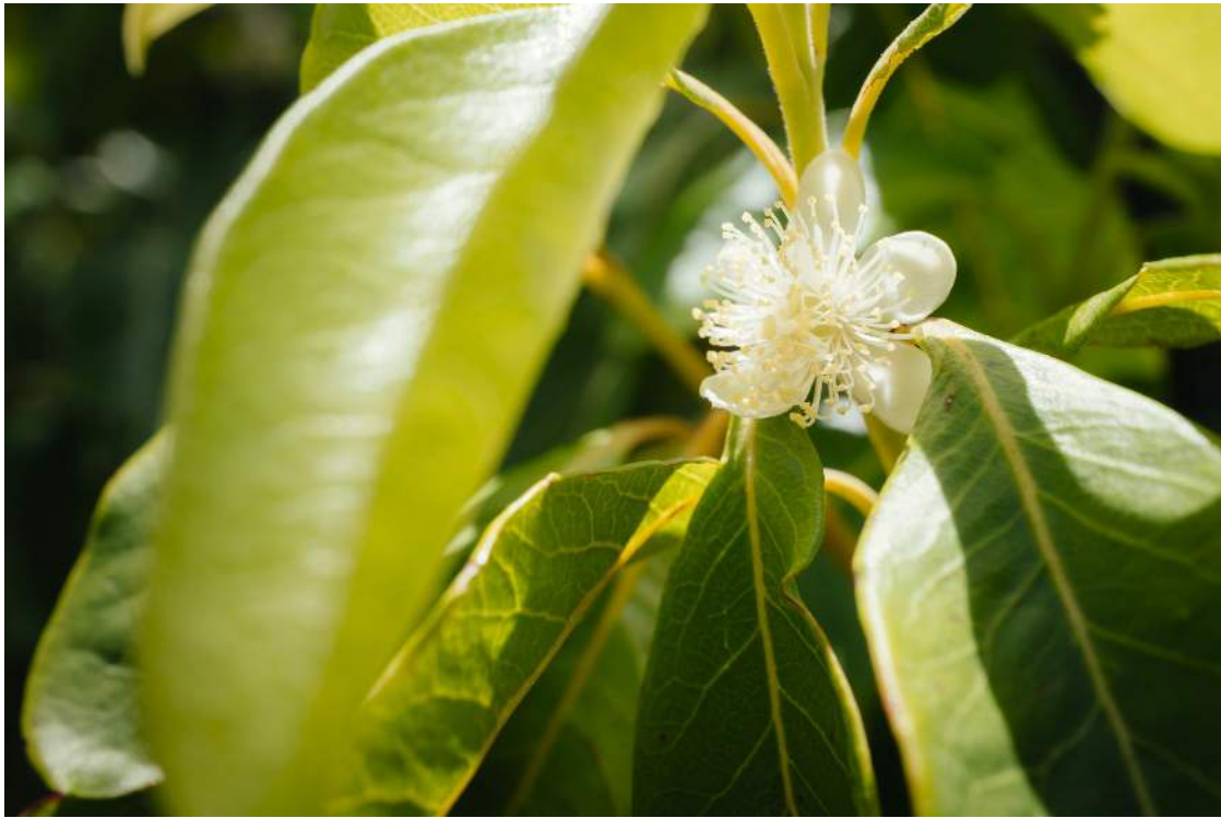
Rhodomyrtus psidioides flower.