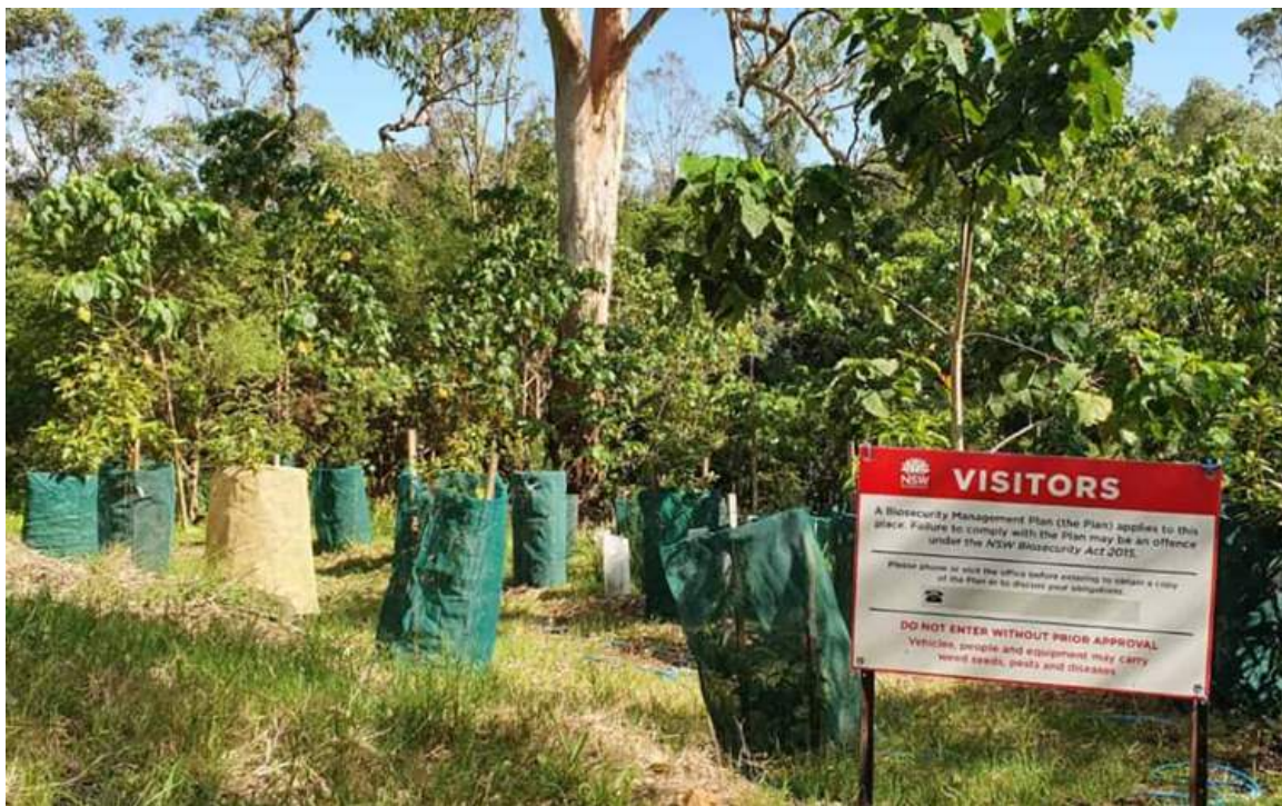
Native Guava ex situ collection at Lismore Rainforest Botanic Gardens.