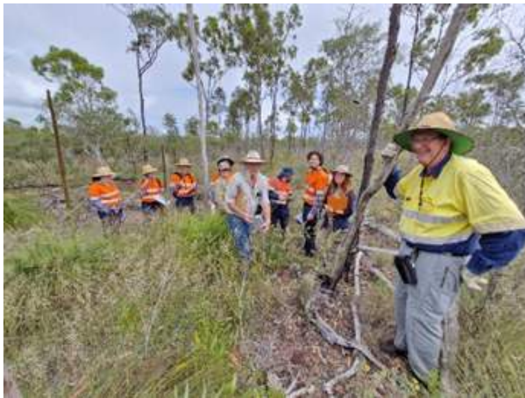
Attendees from the Capricornia Flora Survey Training workshop in the field identifying and recording an unnamed Comesperma species in the Canoona region.

The QTPN contributed enormously to the ANPC's recent highly successful 14th Australasian Plant Conservation Conference in various ways including conference planning and logistics, as well as providing the following: