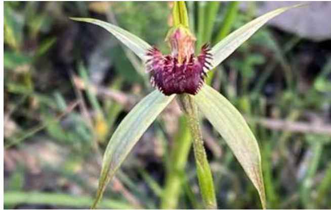
Caladenia ancylosa , one of the 24 threatened plant species.

This project is funded by the Victorian Government Department of Energy, Environment and Climate Action (DEECA) Nature Fund .